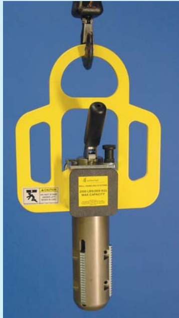
Shown with 3" Mandrel

LIFT · TURN · TRANSPORT · LOAD · UNLOAD · STACK · STORE · PACKAGE · PALLETIZE