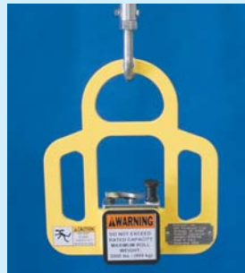
Large, ergonomic handles are provided for positioning the hoisted roll or the empty lifter.

LIFT · TURN · TRANSPORT · LOAD · UNLOAD · STACK · STORE · PACKAGE · PALLETIZE