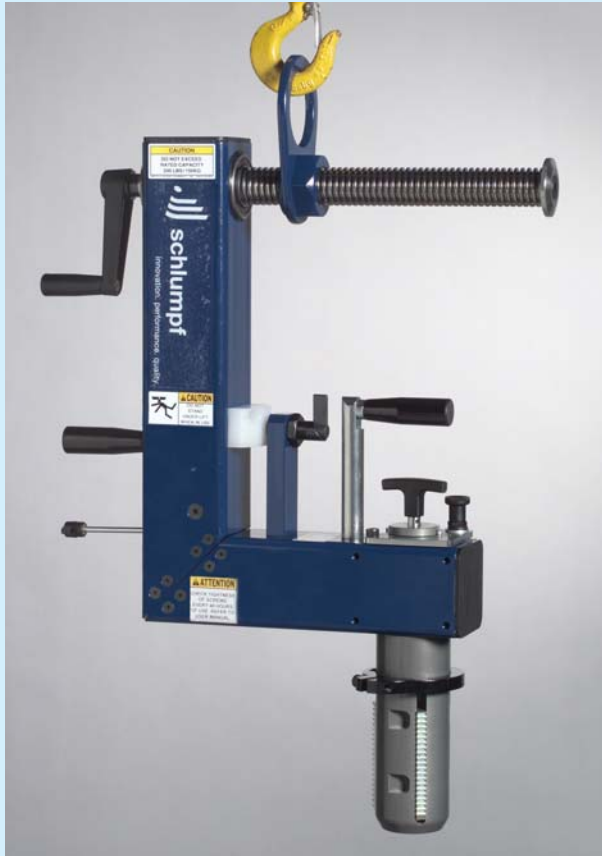
Shown with 3" Mandrel and Core Stop

LIFT · TURN · TRANSPORT · LOAD · UNLOAD · STACK · STORE · PACKAGE · PALLETIZE