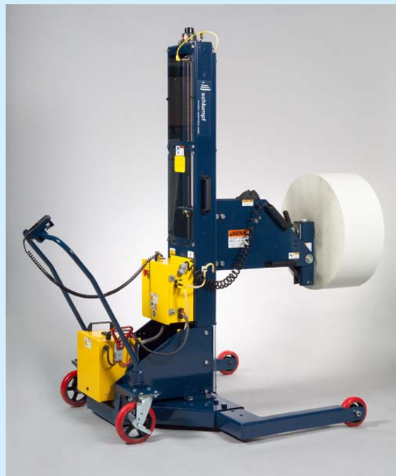
Shown with Turner Tooling & 3" Mandrel