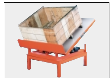
Mounts on 12" Floor Stand (other heights optional)