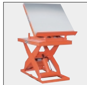
Mounts on Lift Table (Tilts on roller end of table)