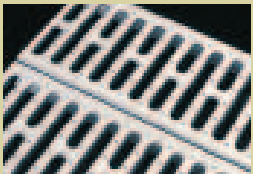
2" galvanized open steel planking